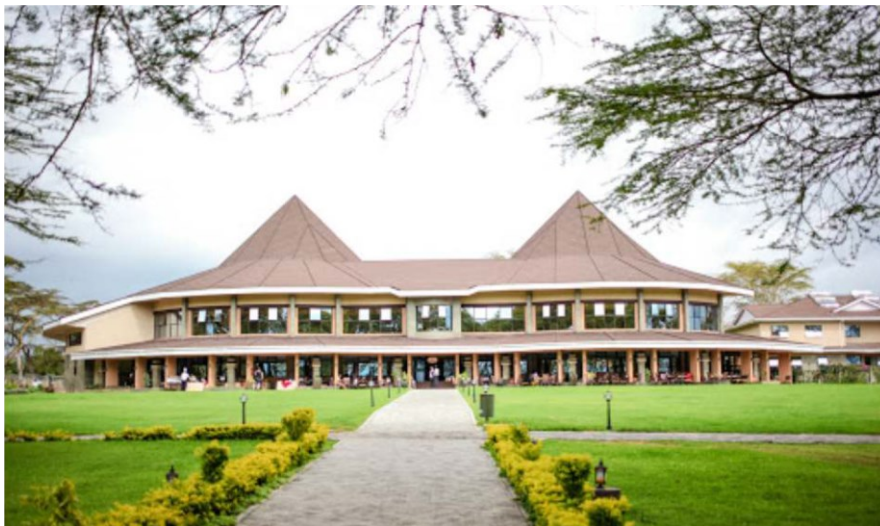
Conference focal point

Multi-Sectoral STI Conference will be held virtually, and the focal point will be at Lake Naivasha Resort , Moi Southlake Road, off Mai Mahiu Road, Naivasha, Kenya.