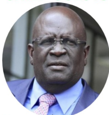
Prof. George A. O. Magoha, EGH Cabinet Secretary Ministry of Education